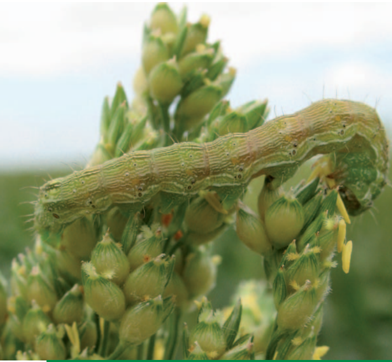
H. armigera .

recessive. The mechanism conferring resistance to Cry2Ab in H. armigera has been shown to be an alteration of a binding site in the gut of the insect.