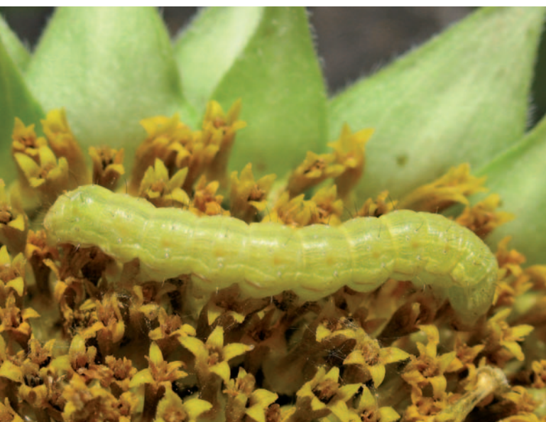
H. punctigera .

The aim of refuge crops is to generate significant numbers of susceptible moths (SS) that have not been exposed to selection pressure from the Bt proteins. As detailed above, this production is especially critical in a drought year because there is reduced contribution from non-cropping vegetation and dryland crops. Moths produced in the refuge crops will disperse to form part of the local mating population where they may mate with any potentially resistant moths (RR) emerging from Bollgard II crops. This reduces the chance that resistant moths will meet and mate. The offspring from matings between one resistant and one susceptible moth will carry one gene from each parent (RS) and are referred to as heterozygotes. In the cases of Bt resistance that have so far been identified, heterozygotes are still controlled by Bollgard II cotton. Therefore, the critical function of the refuge is to dilute the frequency of RR individuals within the population. It is crucial that the timing of the production of moths from refuges