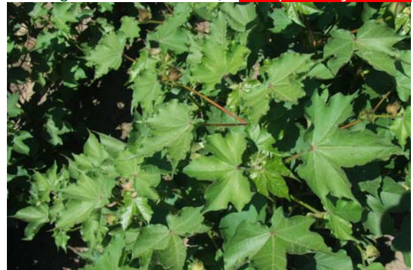
37 days after exposure