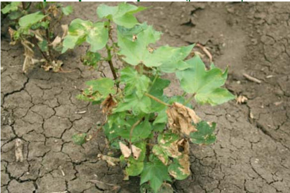
6 days after exposure