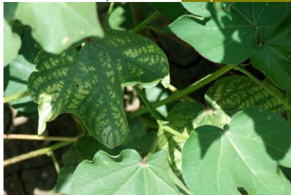
28 days after exposure

Bromoxynil – (symptoms from plants exposed to 30 g a.i./ha at 11 nodes)