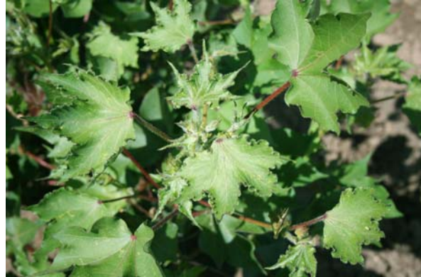
28 days after exposure

2,4-D plus picloram – (plants exposed to 30 + 7.5 g a.i./ha at 8 nodes) Group I – Synthetic Auxin