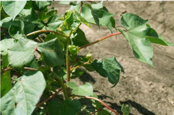
7 days after exposure

2,4-D plus picloram – (plants exposed to 30 + 7.5 g a.i./ha at 8 nodes) Group I – Synthetic Auxin