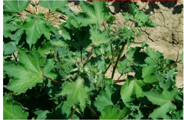
28 days after exposure

Triclopyr plus picloram – (plants exposed to 15 + 0.5 g a.i./ha at 8 nodes) Group Is – Syn Auxin