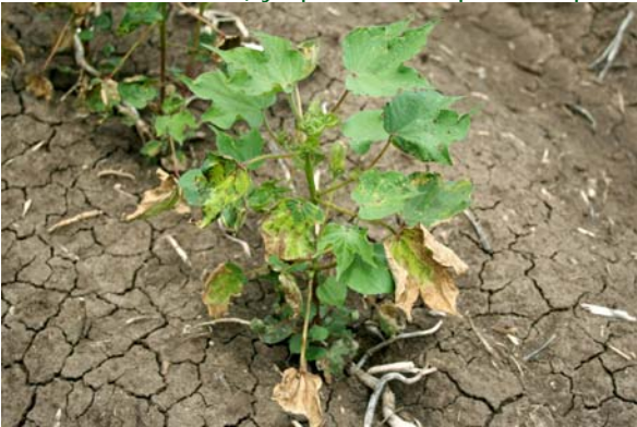
6 days after exposure