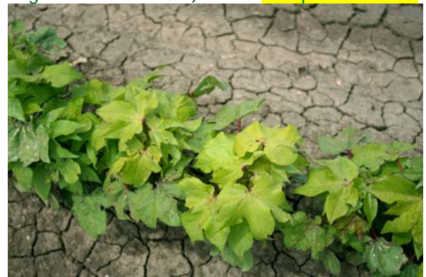
27 days after exposure