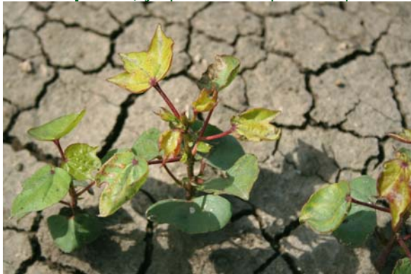
14 days after exposure