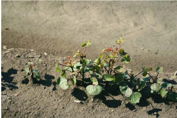
19 days after exposure