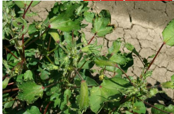
28 days after exposure

Glyphosate & 2,4-D – (plants exposed to 35 + 8 g a.i./ha at 12 nodes) Groups M & I – Syn Auxin