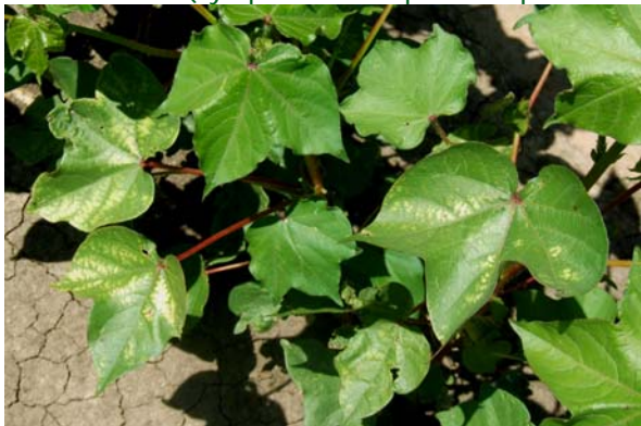
15 days after exposure