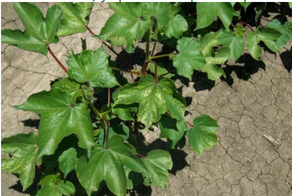
15 days after exposure