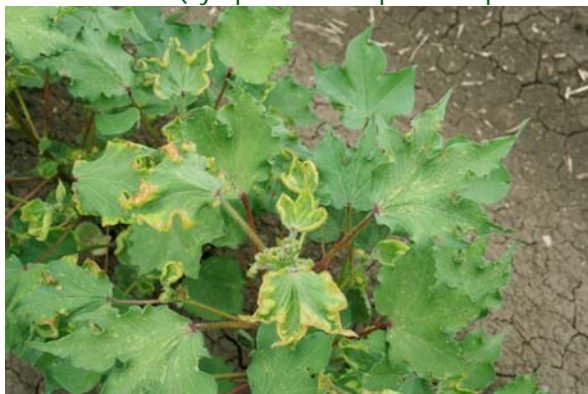
6 days after exposure