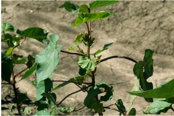
9 days after exposure

MCPA plus picloram – (plants exposed to 42 + 2.6 g a.i./ha at 8 nodes) Group I – Synthetic Auxin