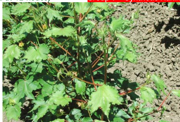
28 days after exposure

Dicamba – (symptoms from plants exposed to 28 g a.i./ha at 11 nodes)