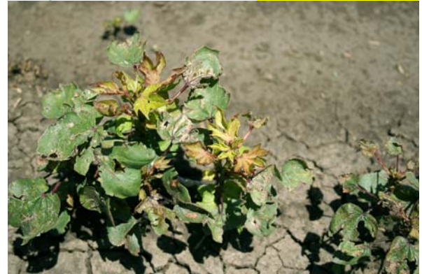
25 days after exposure

Imazapic – (symptoms from plants exposed to 24 g a.i./ha at 4 nodes)