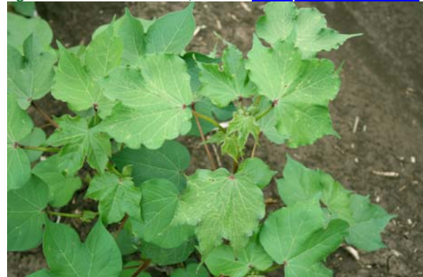
16 days after exposure