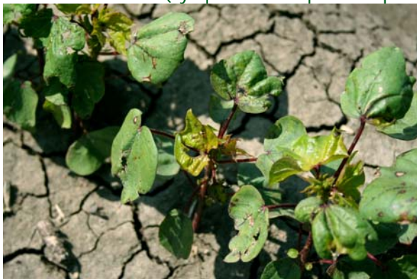
14 days after exposure