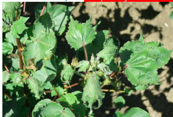
28 days after exposure