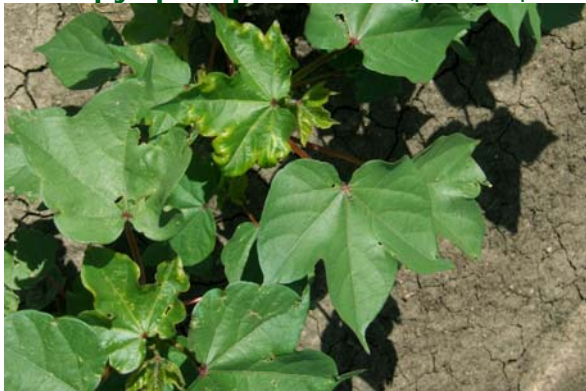
7 days after exposure

Triclopyr plus picloram – (plants exposed to 15 + 0.5 g a.i./ha at 8 nodes) Group Is – Syn Auxin