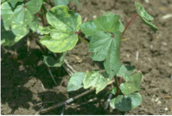
7 days after exposure