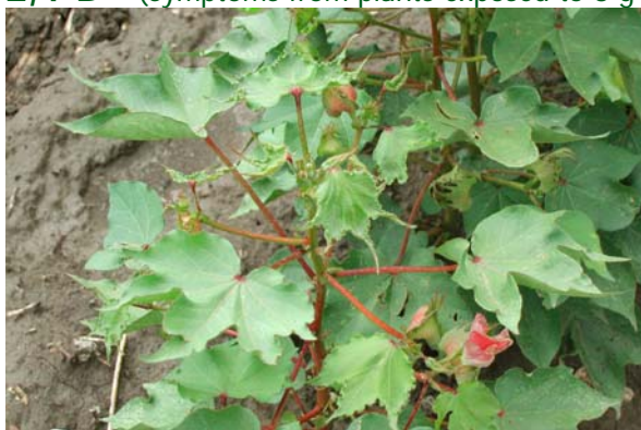
15 days after exposure