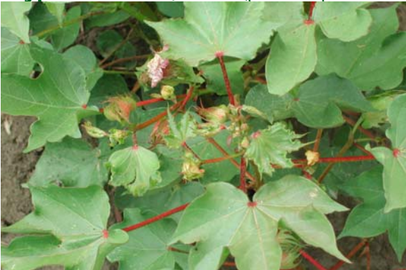
15 days after exposure

Glyphosate & 2,4-D – (plants exposed to 35 + 8 g a.i./ha at 12 nodes) Groups M & I – Syn Auxin