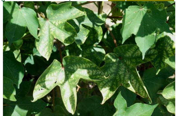
28 days after exposure