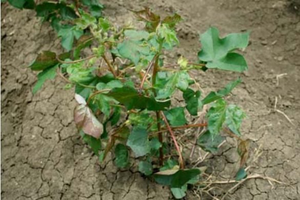
6 days after exposure

MCPA – (symptoms from plants exposed to 105 g a.i./ha at 11 nodes) Group I – Synthetic Auxin