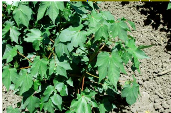
28 days after exposure