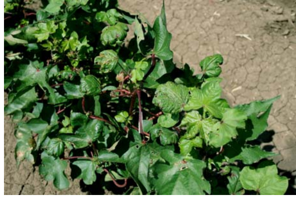
28 days after exposure

MCPA – (symptoms from plants exposed to 105 g a.i./ha at 11 nodes) Group I – Synthetic Auxin