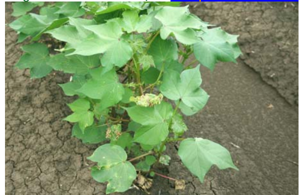
16 days after exposure