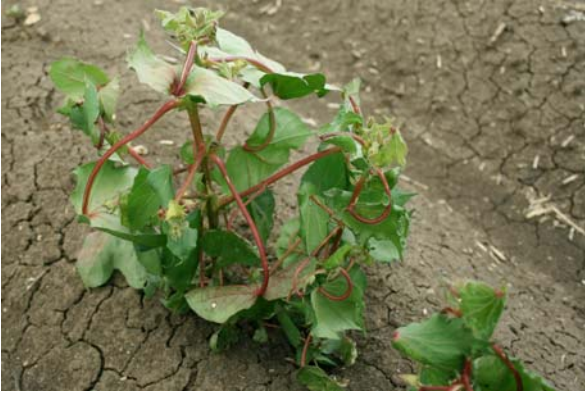
6 days after exposure

Fluroxypyr – (symptoms from plants exposed to 36 g a.i./ha at 11 nodes) Group I – Synthetic Auxin