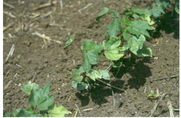
7 days after exposure

Fluometuron – (symptoms from plants exposed to 1 kg a.i./ha pre-planting)