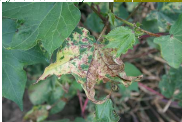
16 days after exposure

Cyanazine – (symptoms from plants exposed to 1.3 kg a.i./ha at 5 nodes)