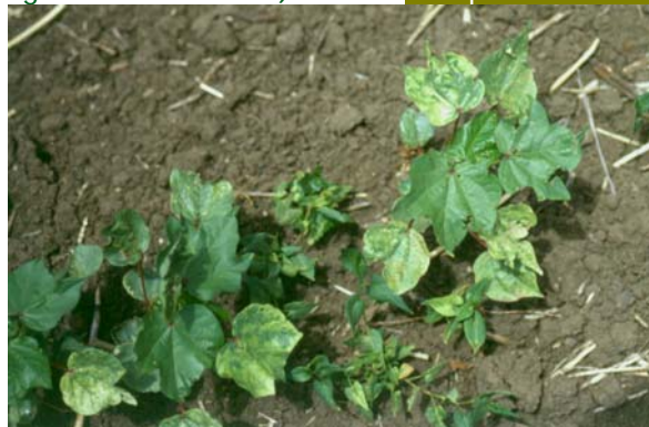
7 days after exposure