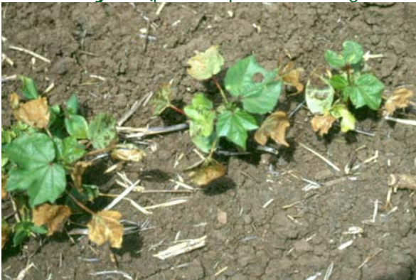
7 days after exposure