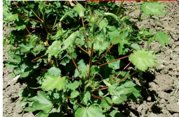
28 days after exposure