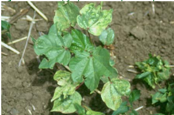
7 days after exposure