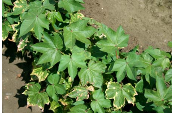
23 days after exposure

Glyphosate – (symptoms from plants exposed to glyphosate drift)