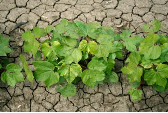
7 days after exposure