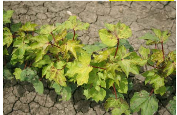
27 days after exposure

Metsulfuron – (symptoms from plants exposed to 2.1 g a.i./ha at 4 nodes)