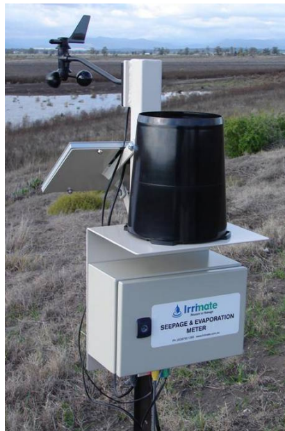
Figure 1 - Irrimate™ Seepage and Evaporation Meter

The Irrimate™ Seepage and Evaporation Meter (Figure 1) was designed to be able to estimate seepage and evaporation losses from an entire storage, and is believed to be the only equipment available to achieve this. Most other methods for measuring evaporation and seepage (such as atmospheric flux techniques or infiltrometers) rely on point source measurements and do not give a value for the entire storage.