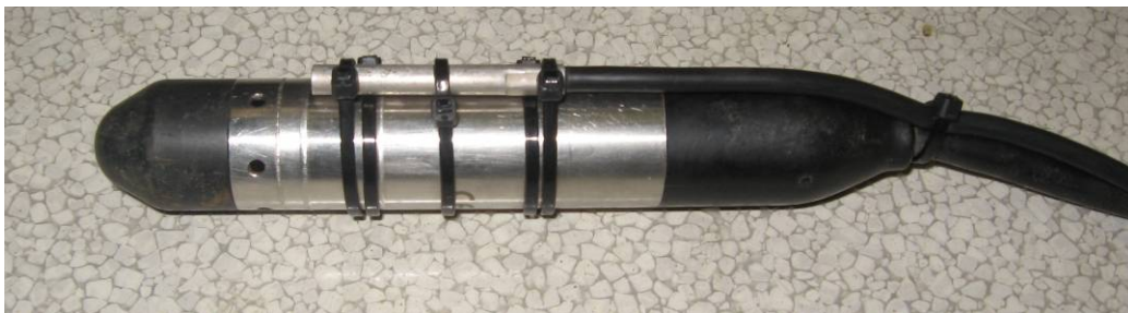
Figure 2 – Pressure Sensitive Transducer

The meter includes a highly accurate pressure sensitive transducer (PST) (Figure 2) which is installed under the water and is able to measure very small changes in water level.