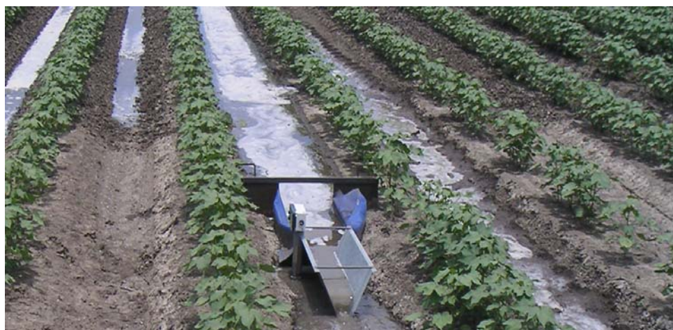
Irrimate™ Flume and Flume Meter

Irrimate™ is an assortment of electronic tools to measure water on and off fields, and water advancement timing. The data collected enables an assessment of how much water has infiltrated the field. Software is then used to simulate different management options to minimise losses and improve irrigation efficiency.