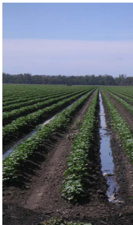
Table 2. Benefits of Monitoring and Change.

Water savings are calculated using the pumping costs associated with furrow irrigation using diesel power as per NSW DPI gross margin budgets 2007. Price per ML increases as fixed water charges and diesel prices increase. Pumping costs will also be dependant upon pumping head where groundwater is used. For the subsequent analysis it has also been assumed that potential water savings as identified by Irrimate™ are the same for all in crop irrigations.