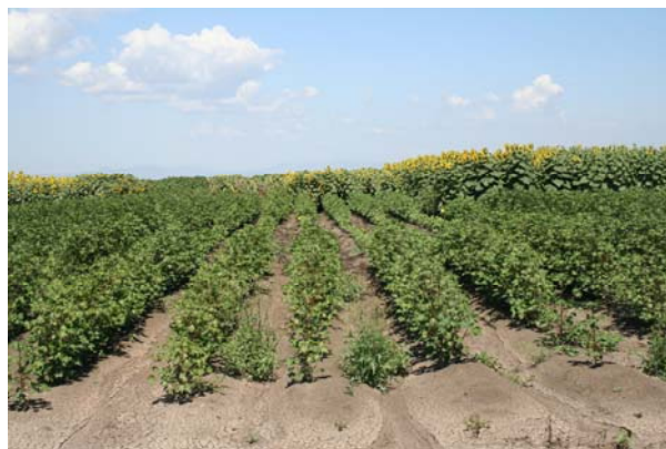
The Critical Period for Weed Control was tested using a range of weeds planted and removed at different stages of crop growth. The effects of weeds on crop growth, development and yield was measured.