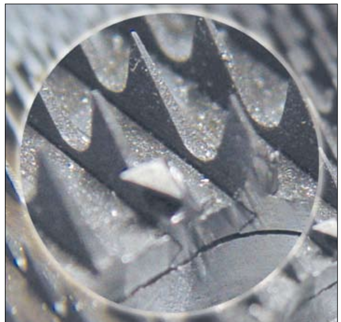
Shows a cross sectional magnified view of the inter-locking mechanism of the wire wound onto the saw cylinder.