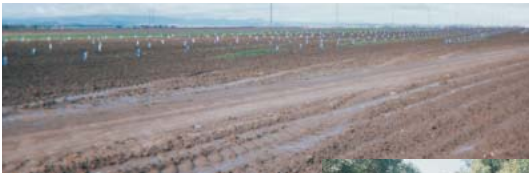
Above, treeline planted 1998 on Oakville boundary near Wee Waa Road, Narrabri. Below and right, same spot and in between rows, April 2003.

Scientific names for all these plants can be found in Appendix D.